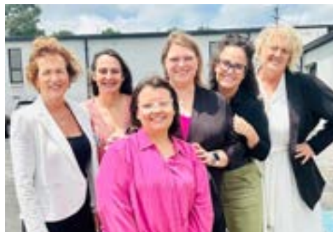
Foundation Staff, 2025