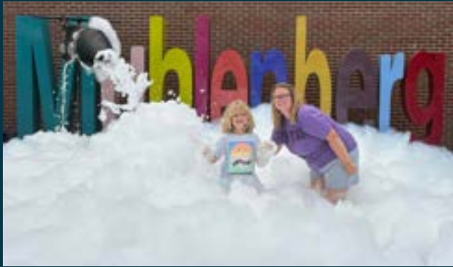
Special Needs Day at Muhlenberg County Fair