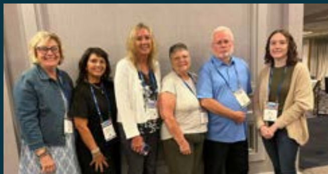
Champions & Celebrate Recovery Volunteers at national training

Thriving communities begin with meeting basic needs. Even when economic and educational opportunities exist, many residents face barriers to accessing those opportunities, keeping them and the greater community from achieving their goals. The Foundation continues to prioritize supporting nonprofits that reduce those barriers, helping residents access critical resources such as food, health care, and recovery options, particularly in times of hardship.