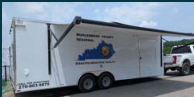
Mobile Disaster Resource Trailer