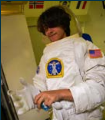
Ignite 8 th Graders attending Space Camp