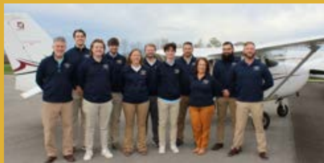
MCC's Aviation Training Hangar Opens