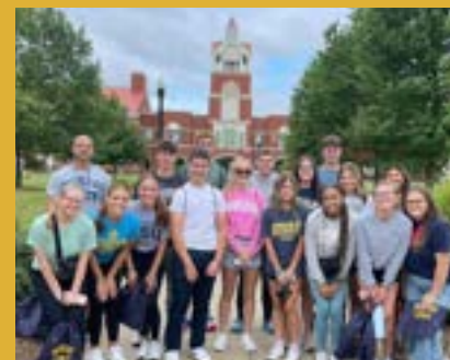
Murray State College Tour