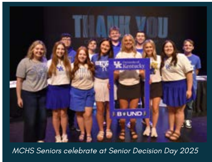
MCHS Seniors celebrate at Senior Decision Day 2025