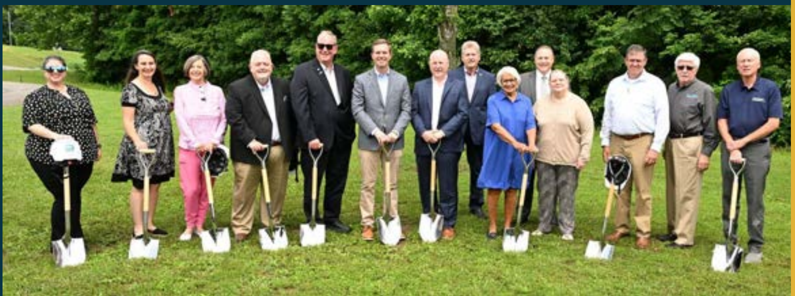
Governor Andy Beshear helps members of MEGA's Board of Directors and the Foundation's Advisory Council celebrate the groundbreaking for BE&E, the first manufacturing facility to be built at Paradise Regional Industrial Park.