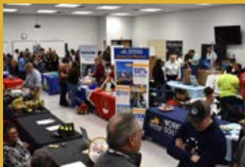
Career Fair at MCHS