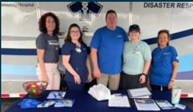
Champions Drug Take-Back Day