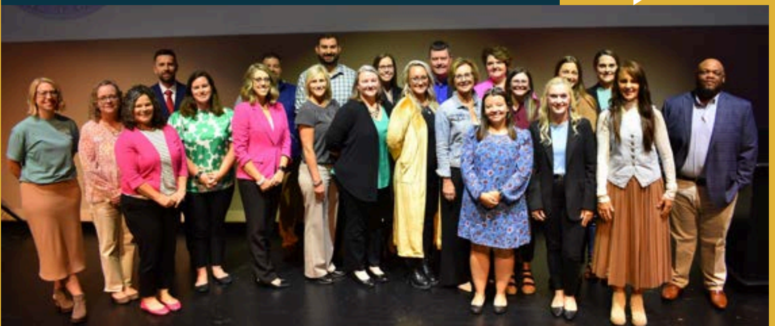
Muhlenberg Civic Leadership Institute Graduates - Class of 2024