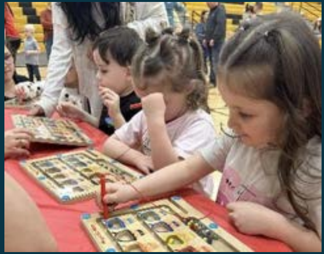
Per-K students at SOAR's Getting Ready 4 Kindergarten Workshops

At the heart of long-term community growth is educational opportunity. This year the Foundation approved over $1 million in new funding to support learning, from early childhood literacy to adult workforce training.